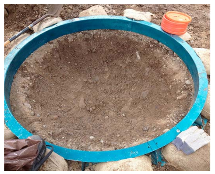
FIG. 4 Test Pit Excavation

12.9.9 Inspect the surface of the material within the template. Cover any sharp edges with duct tape or other suitable material to prevent tearing or puncture of the liner. Mortar, or other suitable material, may be used to fill recesses to eliminate sharp edges, overhangs, or pockets that cannot be smoothed or eliminated. The volume of the material used must be able to be determined and provisions to do this made accordingly.