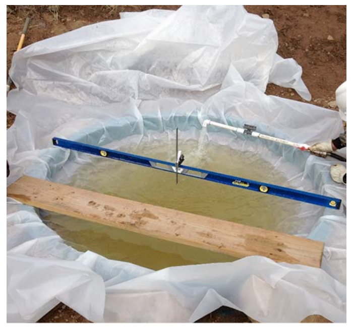
FIG. 3 Measuring the Water-Level Reference with a Carpenter's Square

avoid artificial saturation of the in-place materials. If leakage is excessive, the test area shall be abandoned.