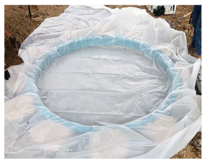
FIG. 2 Plastic Liner Placed in Preparation for the Initial Volume Determination

12.8.4.1 Inspect for water leakage by looking for bubbles, observing the water level over an appropriate time. If the liner is transparent, look for darker areas in the in-place material surface indicating saturation from the test water. If water leakage is present, quickly vacate water from the template to