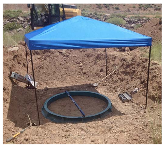
FIG. 1 A 6-ft [1.8-m] Diameter Metal Ring for Determining In-Place Density

7.7 Liners —Material used to line the excavation and retain the test water should be approximately 4 to 6 mil [100 to 150 \mu m] thick. Two pieces, each large enough to line the test pit prior to and after excavation, with about 3 ft [1 m] extending beyond the outside of the template in both cases. Any type of